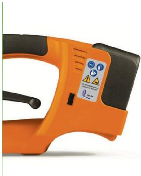
Convenient battery removal system.